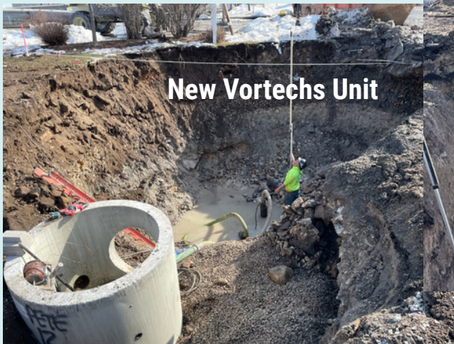
New Vortechs Unit