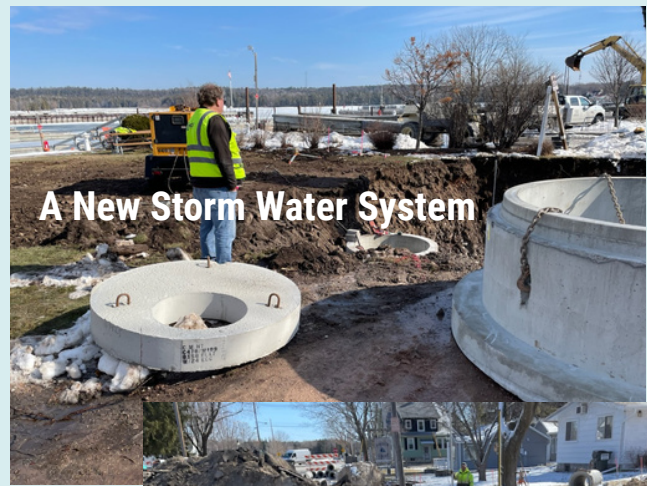
A New Storm Water System