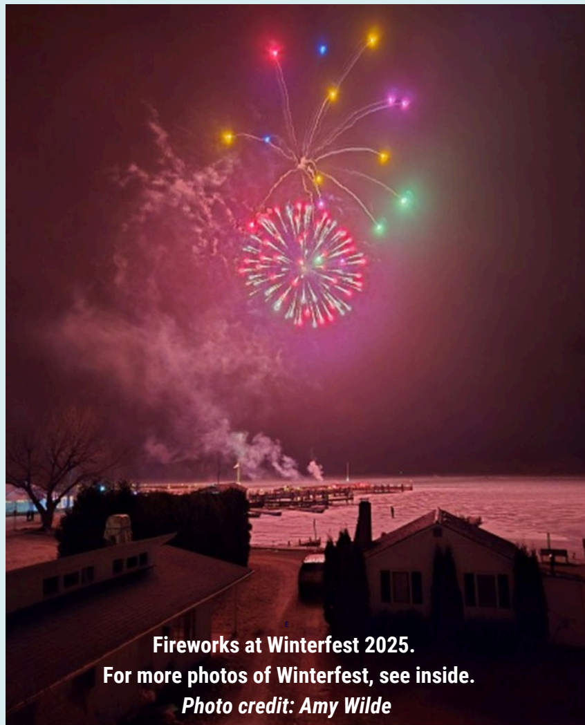
Fireworks at Winterfest 2025.

Catch the latest in Gibraltar: Fish Creek, Juddville, Maple Grove... with our dynamic newsletter covering all the Town's highlights