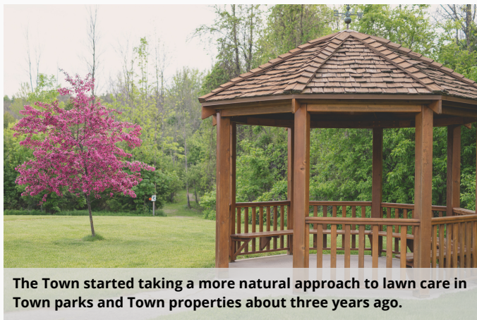
The Town started taking a more natural approach to lawn care in Town parks and Town properties about three years ago.

Learn more about Green Tier in Gibraltar on the Town website .