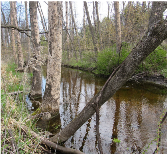
The dying ash trees along the creek once provided shade that kept the creek waters cool for fish and other wildlife.