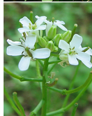
Honeysuckle (left) and Garlic Mustard are two common invasive plants in Gibraltar and easily identified.