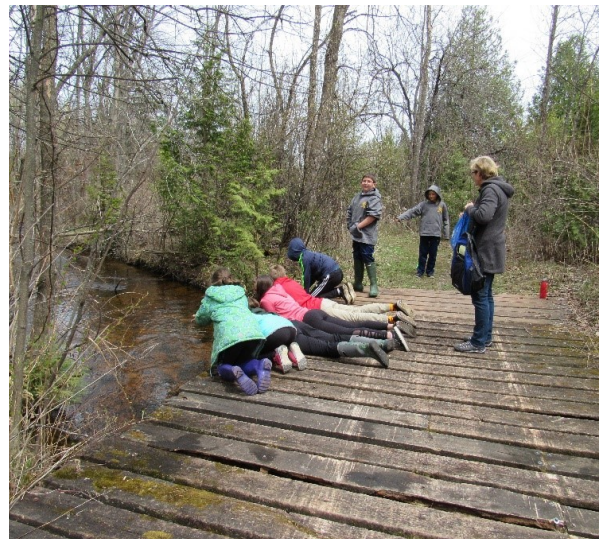
Gibraltar students look for macroinvertebrates in Fish Creek Park.