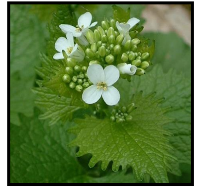
Second-year garlic mustard plant in flower.