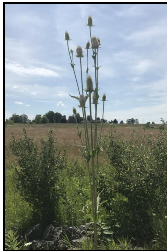
Cut-leaf Teasel in flower near Ellison Bay.

Projects eligible for cost share funding must have a definite probability of significantly reducing the priority invasive species. Priority will be provided to first time applicants with no more than five municipalities selected in a calendar year. SWCD municipal cost sharing shall not exceed 50% of the total costs for the treatment of the invasive species. Municipalities may apply for the cost share funds at the SWCD office by completing and submitting a short proposal of the priority invasive species control program and a Request of Municipal Cost Share form. For more information, contact Krista Lutzke at the Door County Soil and Water Conservation Department at 920-746-2363 or klutzke@co.door.wi.us .