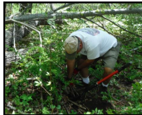
Rushes volunteer works to remove Japanese barberry in 2016.

The Rushes Wilderness Foundation will be holding spring workdays on The Rushes property near Kangaroo Lake, working on activities such as invasive species control, trail maintenance, and tree care. The workdays will be May 1, 2, & 3 (Tues, Wed, and Thurs) and May 29, 30, & 31 (Tues, Wed, and Thurs). Those interested in volunteering can pick one, two, or all three of the days to help. The workdays will begin at around 9:00am and will last until 5:00pm on Tuesdays and Wednesdays, and 9:00am to noon on Thursday. Lunch will be provided and wine, beer, soda, cheese, etc. after work on the first and second days. If you'd like to volunteer or need lodging information, contact Margaret Pagels at margaret@therushes.com or 920-839-2730.