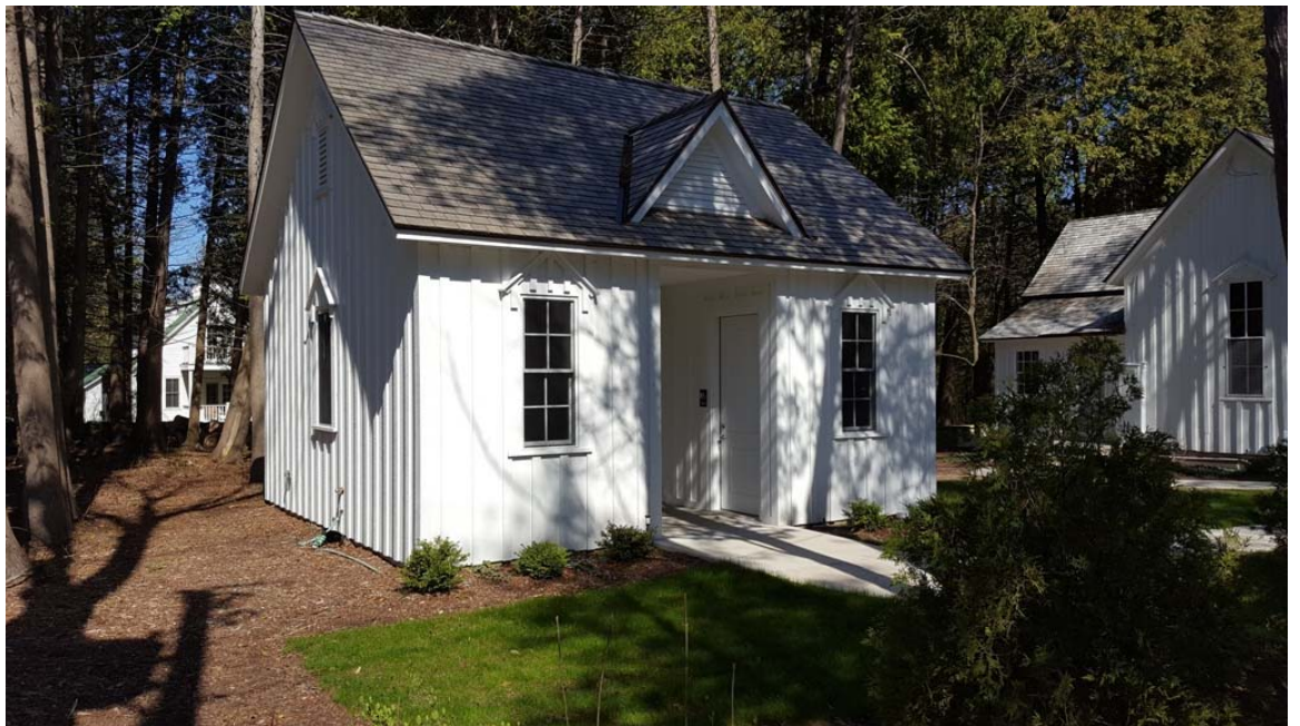
Newer Public Restroom on West Side of Town