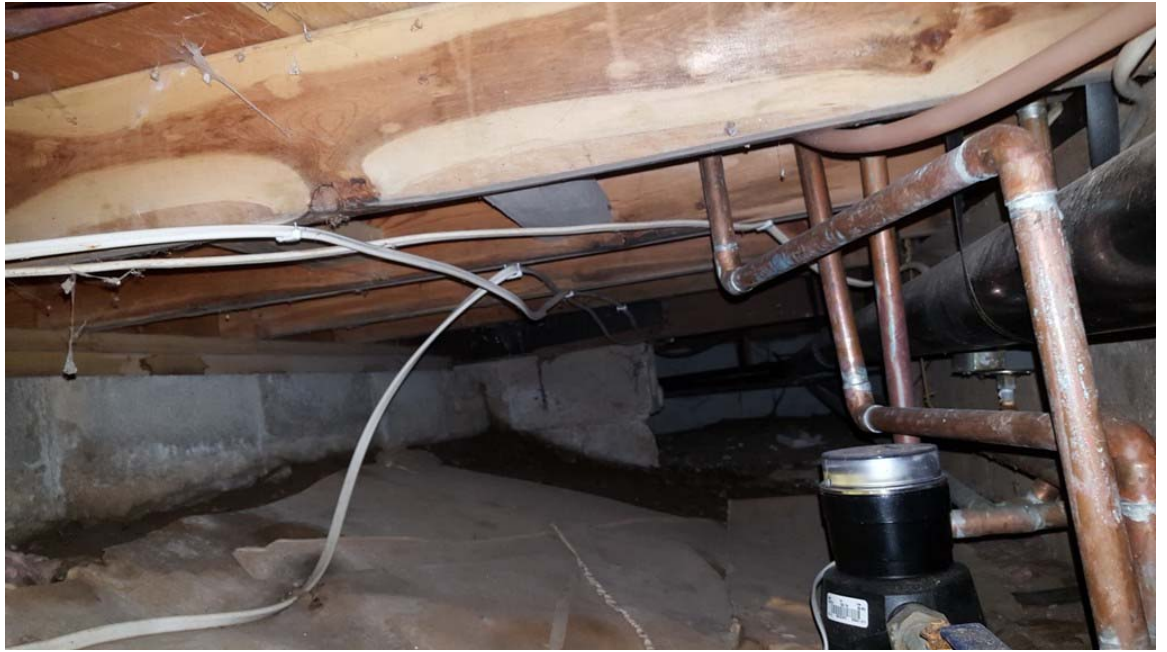
Crawl Space Below Addition