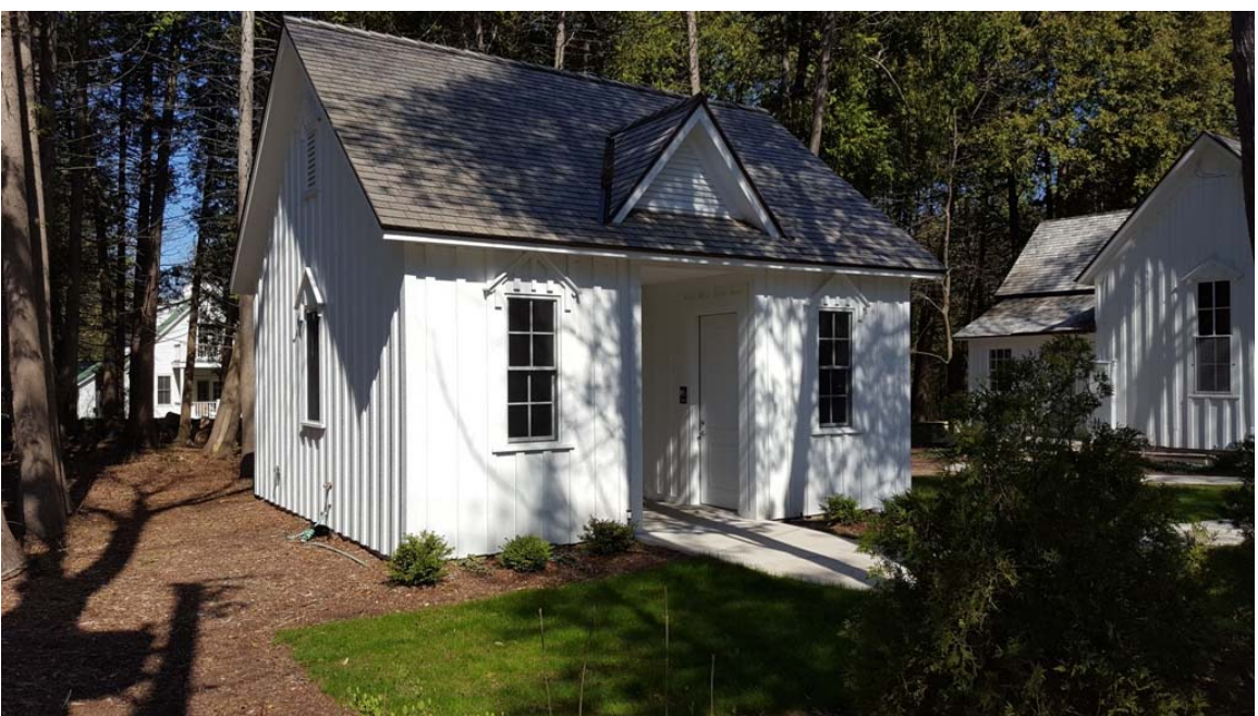
Newer Public Restroom on West Side of Town