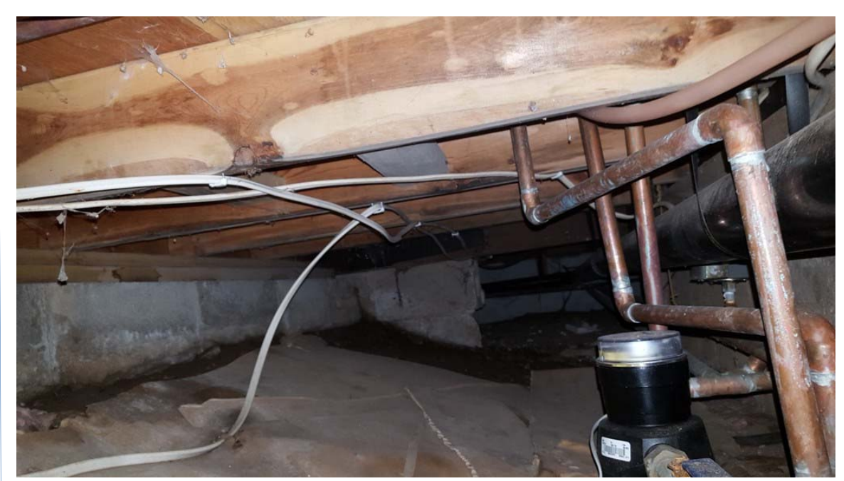
Crawl Space Below Addition