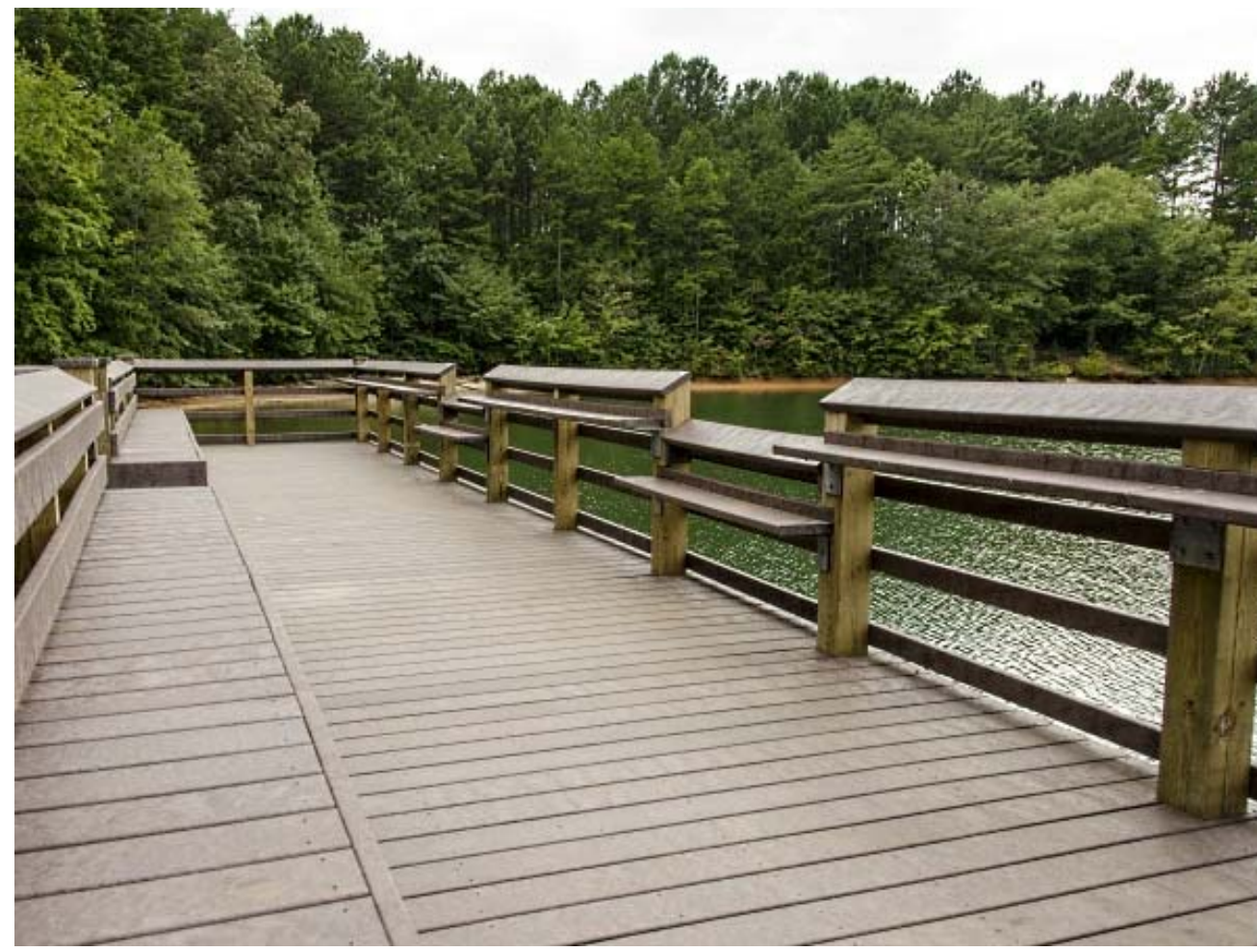
REPAIRS TO PIER - NEW DECKING, RAILS AND BENCHES