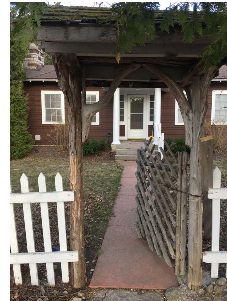
UTILIZE EXISTING ELEMENTS