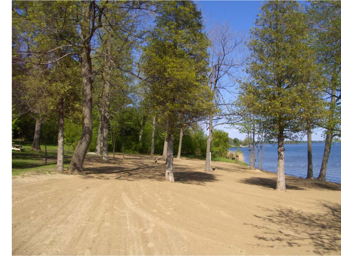
SUNNY AND SHADY AREA OPTIONS