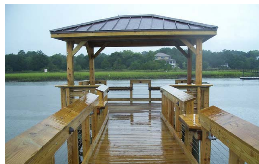
POSSIBLE PIER UPGRADES - SHELTER