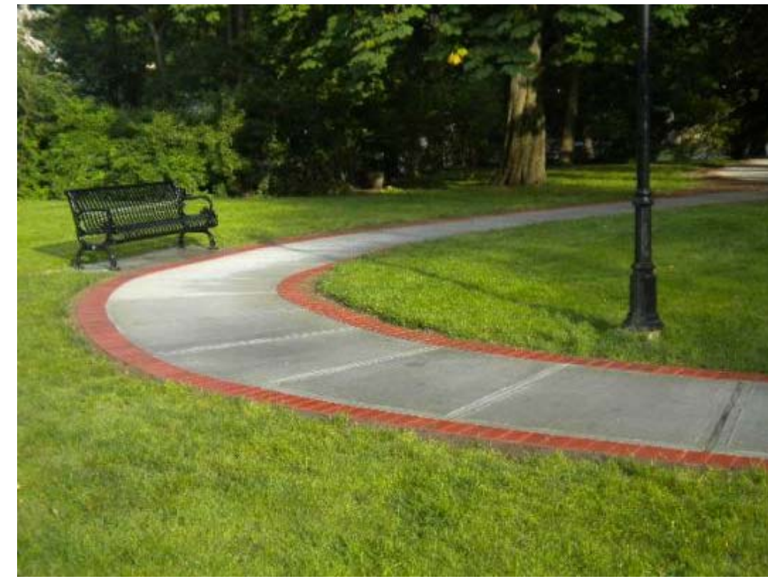
ACCESSIBLE PATH THRU PARK