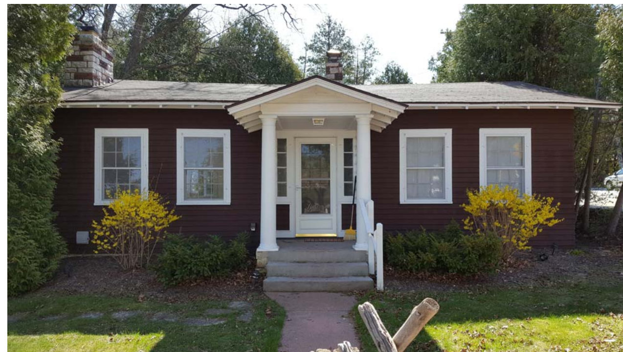
INCORPORATE LOCAL STYLE INTO NEW STRUCTURES