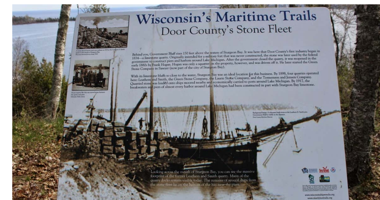
HISTORICAL / EDUCATIONAL INFORMATION POINTS